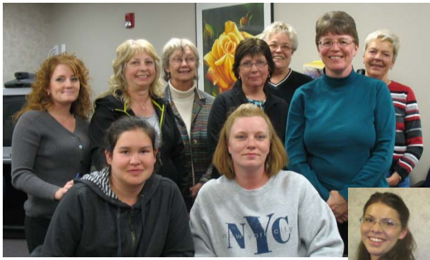
Spring and Fall Volunteer Training brought us many new volunteers